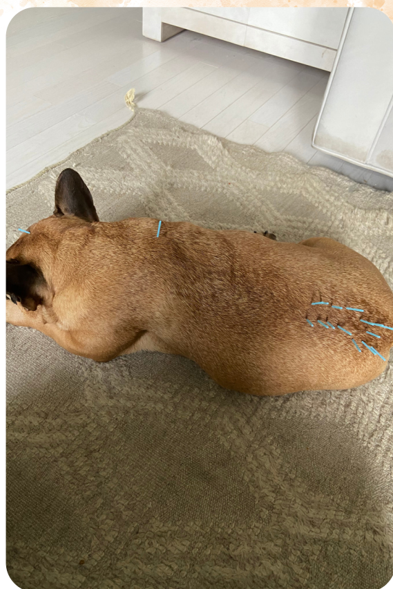
'Ike receives acupuncture for her congenital spinal issues'

Physiologically, Qi flows throughout the body all the time, maintaining a balance of Yin and Yang. When the flow of Qi is interrupted by any pathological factor (such as a viral or bacterial infection), the balance of Yin and Yang will be disrupted and consequently, a disease may occur. Pain is interpreted as the blockage of Qi flow. Acupuncture stimulation resolves this blockage, freeing the flow of Qi and enabling the body to heal itself. Homeostasis is restored when Yin and Yang Qi are in balance.