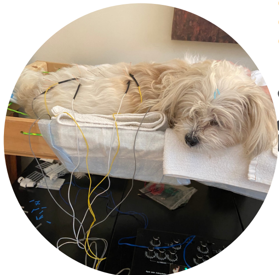
'Ginger receives electroacupuncture for paresis'